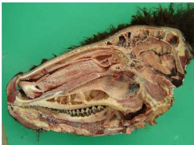
Figure 3 Bison

North American bison were first farmed in the UK in the mid-1990s. These animals are not aggressive, but 'defensive'. They have a large flight-zone and when approached will form an outward-looking circle. They can be difficult to put through traditional cattle-handling systems and can get very agitated when confined in such. Like water buffalo, bison have a very thick frontal bone (up to six times that of a domestic bovine at any given age), therefore effective, captive-bolt stunning might be difficult to achieve (see Figure 3). Bison can be field-slaughtered by a marksman, then abattoir-dressed; alternatively they can be transported to the abattoir and shot dead in the trailer prior to dressing.