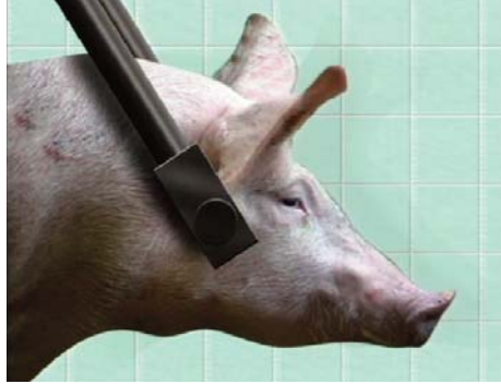
Alternative electrode position