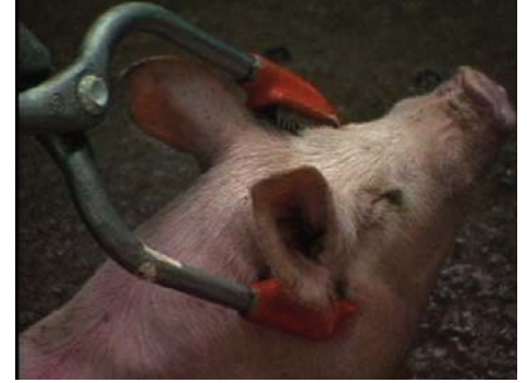
Diagonal electrode position