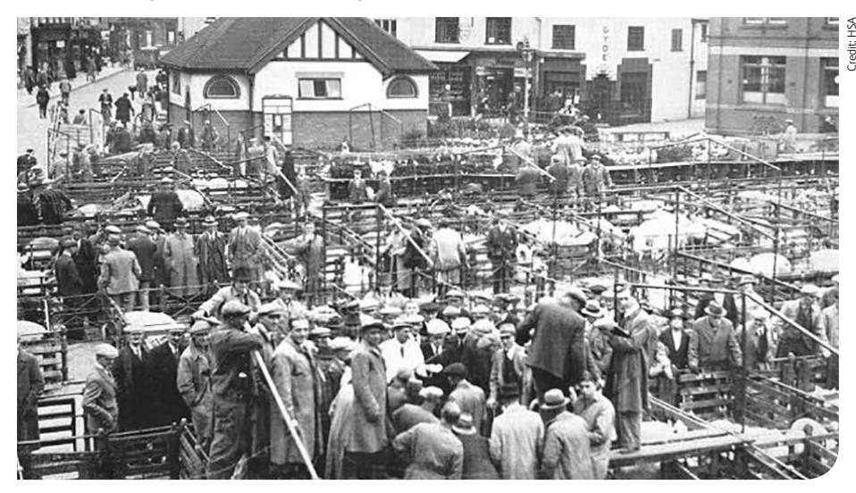
Traditional market scene

The year 2017 saw the two-hundredth anniversary of the opening of the first, purpose-built, livestock market in Hawick. To mark this important milestone in the history of the UK's meat and livestock industry, and at the request of the Livestock Auctioneers Association (LAA), the HSA has been carrying out an independent survey of a sample of 24 markets across England and Wales. To date 16 markets have been visited and the aim is to complete the survey visits by June 2018. Following the field-work, confidential reports will be sent to each participating market and a review report, highlighting the impact of infrastructure, procedures, staff training and management practices on the welfare of animals together with any necessary recommendations, will be sent to the LAA. The information gathered will be used to disseminate details of good practice and innovative handling systems to all those involved with animal handling and livestock marketing.