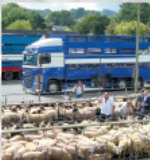
Welfare during transport training material wins Gold Award