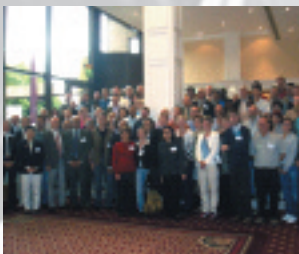
Delegates at the international workshop run by the HSA for the European Commission

1994 The HSA's training video 'Humane Slaughter – Taking Responsibility' was launched. Subsequently it received a Gold Award from the International Visual Communications Association (IVCA).