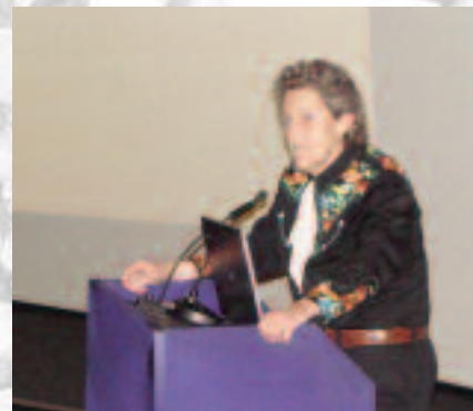
Professor Temple Grandin, Colorado State University, gave a presentation on auditing animal welfare and practical improvements in beef, pork and sheep slaughter plants.