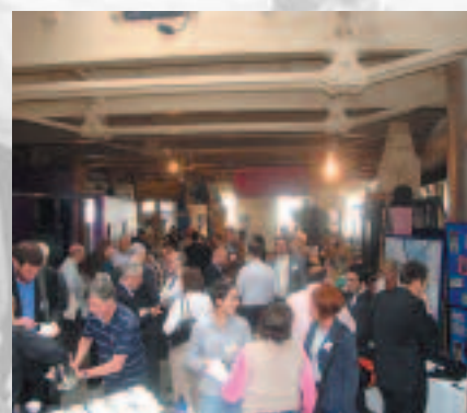
Networking time during a break in presentations.