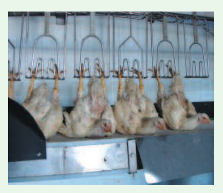
Broiler chickens on the breast support conveyor system

Further studies will investigate how best to implement this approach in a commercial setting.