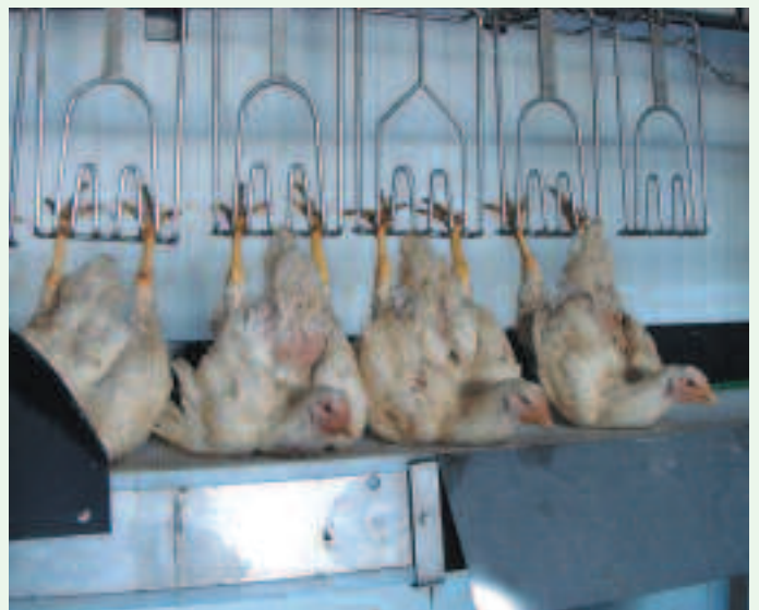
Broiler chickens on the breast support conveyor system

Further research and development is needed to refine this equipment before it can be installed in processing plants on a fully commercial basis and the project team is seeking further funding for this.